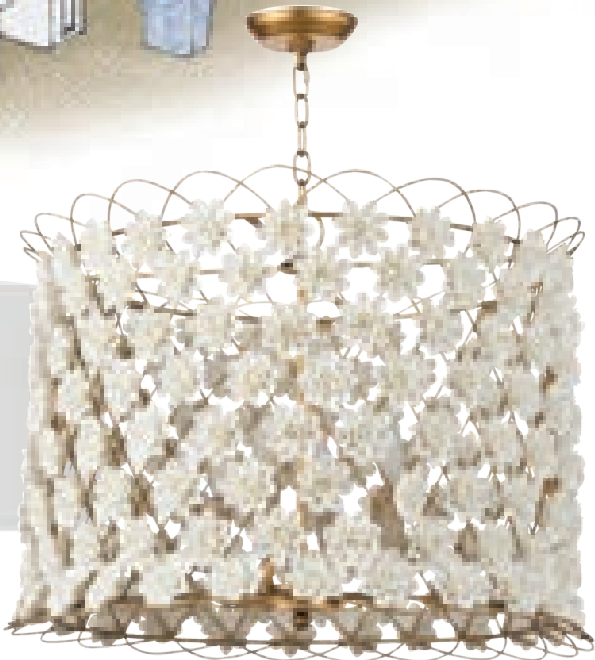
Alice Chandelier by Regina Andrew Design