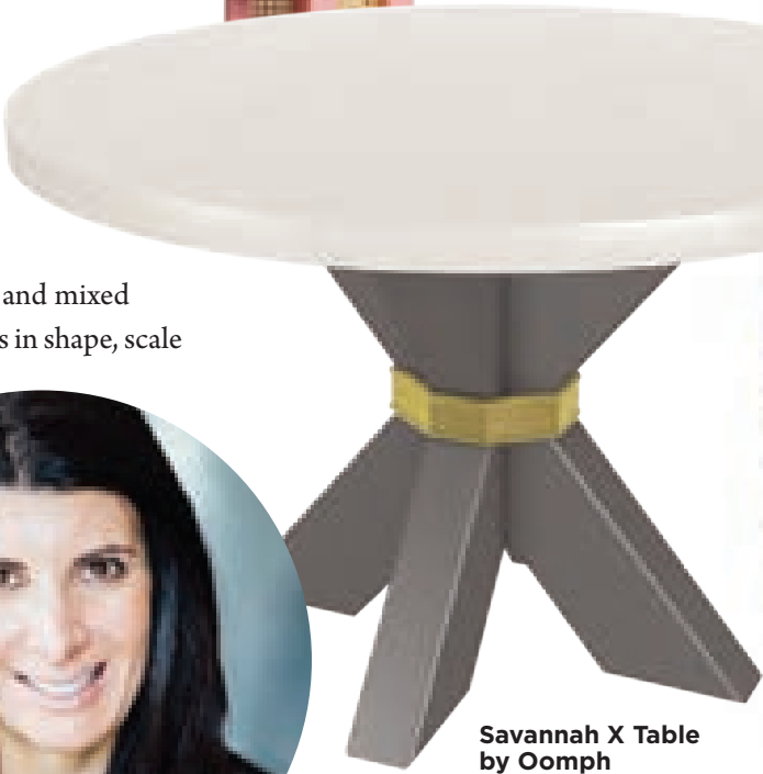
Savannah X Table by Oomph